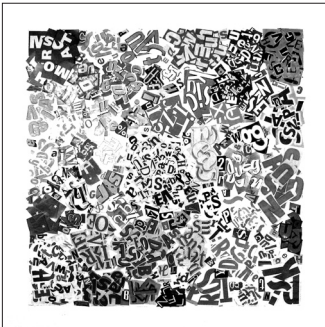
Chaos Starting College